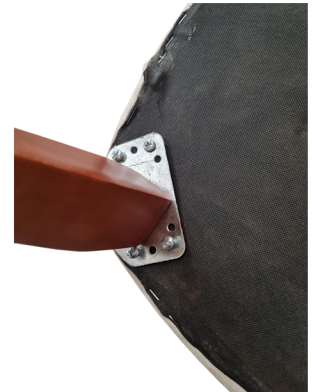
Attached Front Leg

There are bolt in the pre-drilled holes. Unscrew them first. Place the front leg in a way that holes on the seat and legs match each other. Place and screw to bolts as it is shown in the photo on the right.