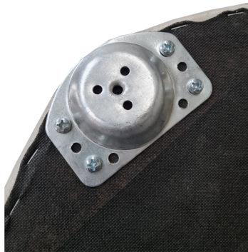
Hind Leg Part

Turn the seat upside down. There are screws in the pre-drilled holes and metal pieces to mount hind legs.