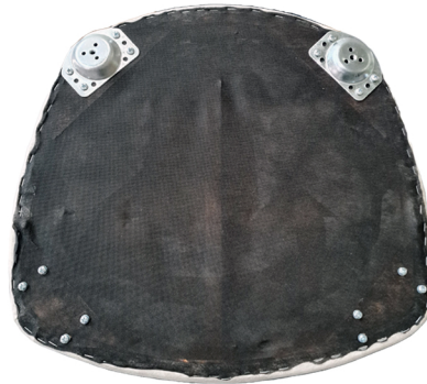
Bottom of the seat

Turn the seat upside down. There are screws in the pre-drilled holes and metal pieces to mount hind legs.