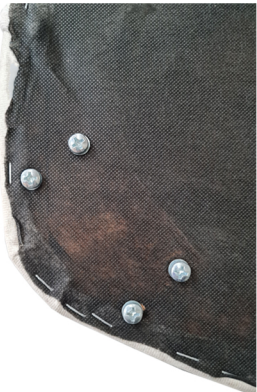
Front Leg Part

There are bolt in the pre-drilled holes. Unscrew them first. Place the front leg in a way that holes on the seat and legs match each other. Place and screw to bolts as it is shown in the photo on the right.